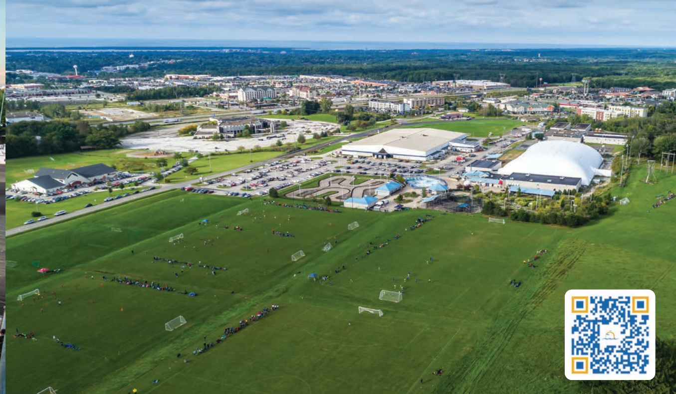
Erie Sports Center // ERIEBANK Sports Park // Oliver Road Erie, PA 16509

The Erie Sports Center boasts a newly-installed FIFA-accredited turf inside a four-season dome, 10 outdoor grass fields and four basketball/volleyball courts. The facility regularly hosts soccer, lacrosse, football, basketball, volleyball, wrestling and martial arts.