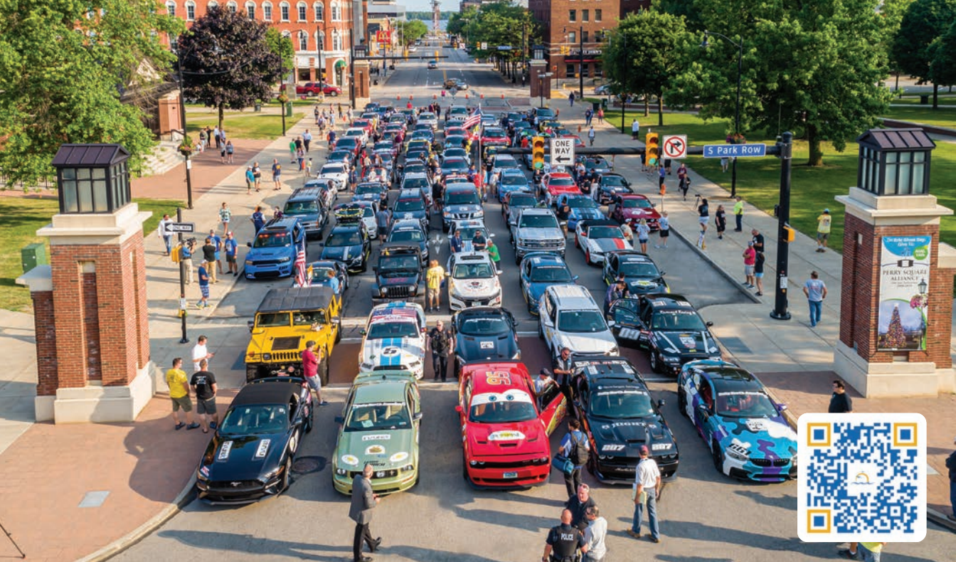
Downtown Erie // Perry Square

From fun runs to festivals, Downtown Erie can accommodate events of many sizes. Perry Square is central to downtown Erie and features a stage with sound capabilities built in. The area has hosted The Color Run, the Great Race, Lake Erie Cyclefest, and is a regular host of concerts and festivals. Local shopping and dining options line the streets, offering fare to suit a variety of tastes, all within short walking distance.