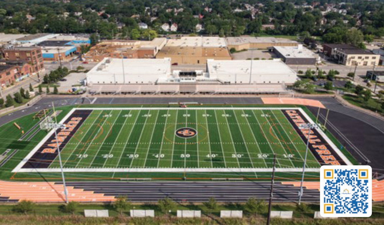
Hagerty Family Events Center // 501 W 12th Street Erie, PA 16501

This multi-functional facility is located in Downtown Erie, and has the ability to host a multitude of events, including football, swimming, basketball, volleyball and lacrosse. A concourse area offers banquet-style seating for 100-plus guests, on-site catering, and live streaming capability. The facility features 350 on-site parking spaces, in addition to many nearby parking opportunities.