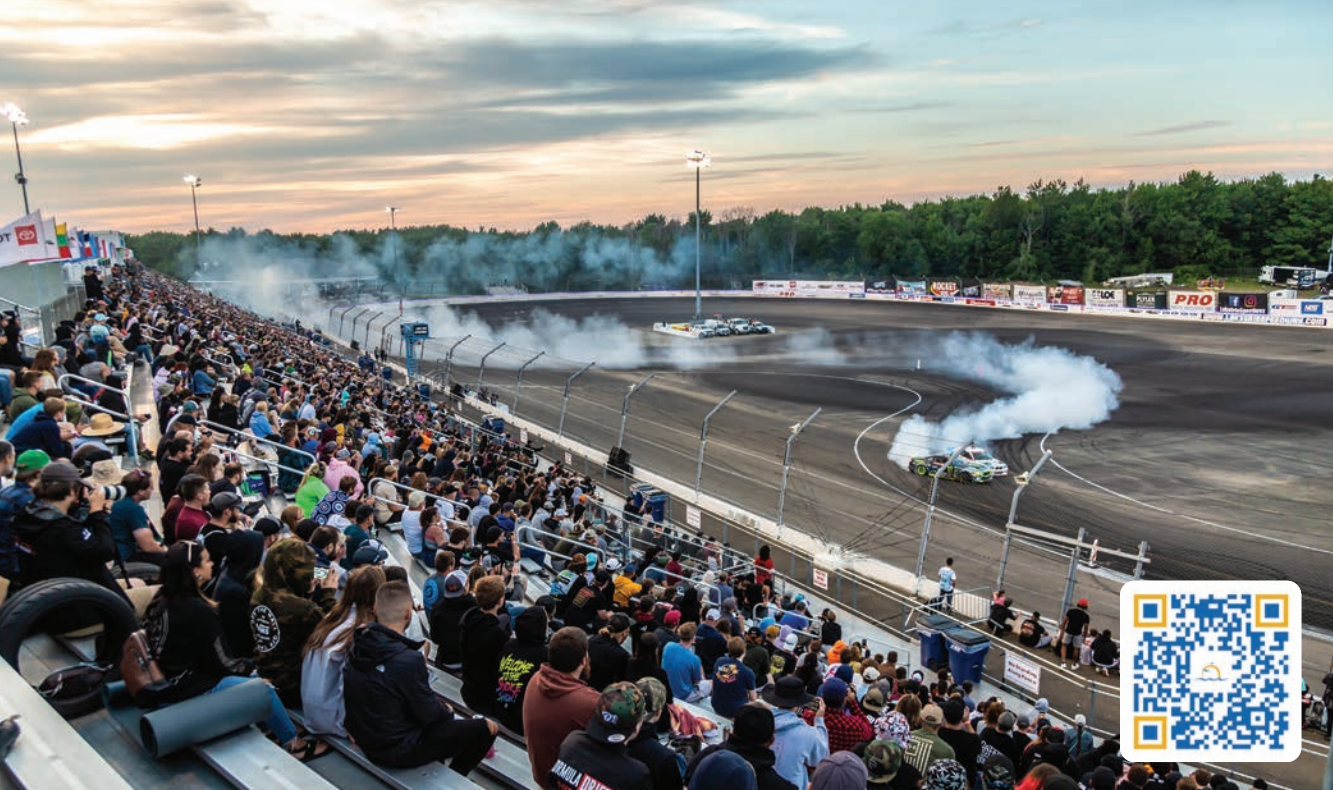
Lake Erie Speedway // 10700 Delmas Drive North East, PA 16428

With a 3/8-mile asphalt, oval speedway and 120 acres of land surrounding, Lake Erie Speedway can host events of many kinds. The $12 million motor sports and event venue features a premium sound system, Musco lights, and a main grandstand seating capacity for 6,000.